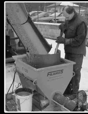
Filling the tank with ready-made mixture