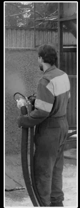
Wet method shotcreting