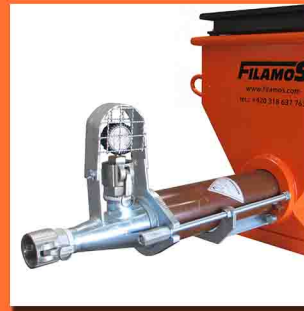
Transport screw (Stator / Rotor system)